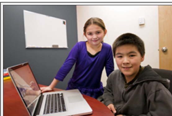
Will your children one day get access to quality broadband telecommunications that are available to most Canadians living in urban centres? The CRTC took a big step towards achieving that objective late last December, when they re-defined Canada’s universal basic telecommunications service objective as 50 Mbps download and 10 Mbps upload. They also said that the landline voice phone is a fading technology and the only medium that matters is broadband internet.

In its first year, the fund would make $100 million available for broadband subsidies and rise to $200 million by its fifth year.